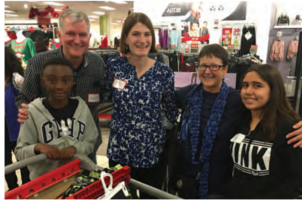
Congregation Or Ami