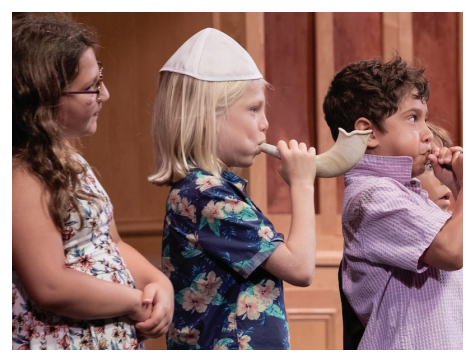
Discover deep connections with Torah, Israel, and the Holy One