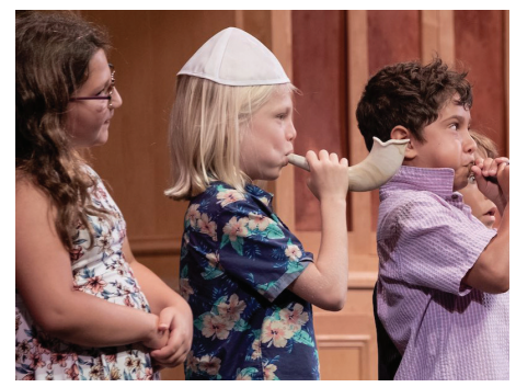
Discover deep connections with Torah, Israel, and the Holy One